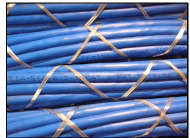
Cable bundling (For faster pulls and structured installs)

Allow our design team assist you with your custom wire and cable requirements