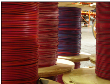
Wire identification (Numbering, Striping etc.)